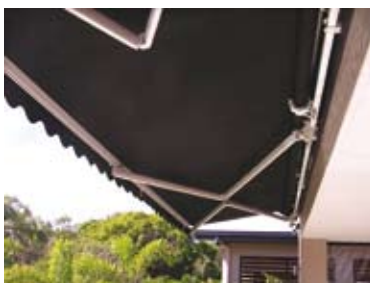
Amount of pitch available with the adjustable pitch control option